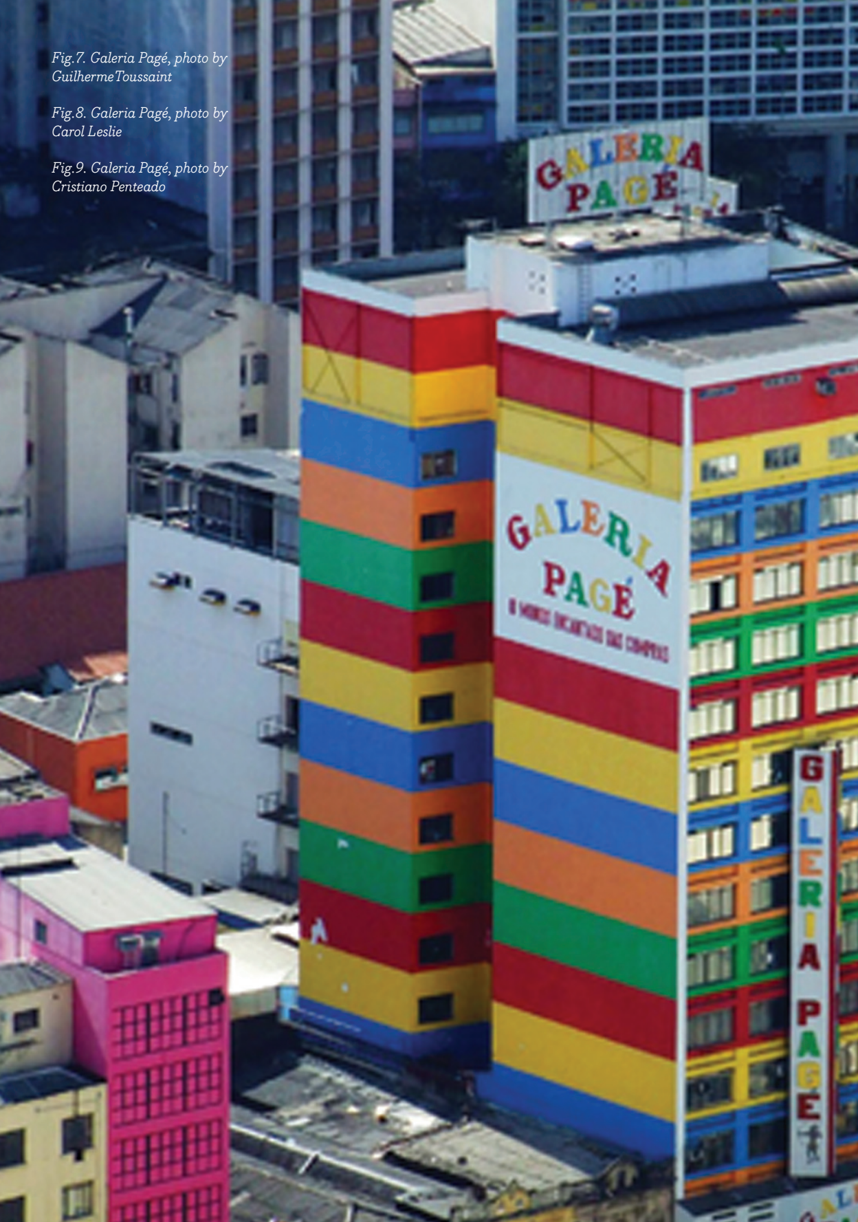
Fig.9. Galeria Pagé