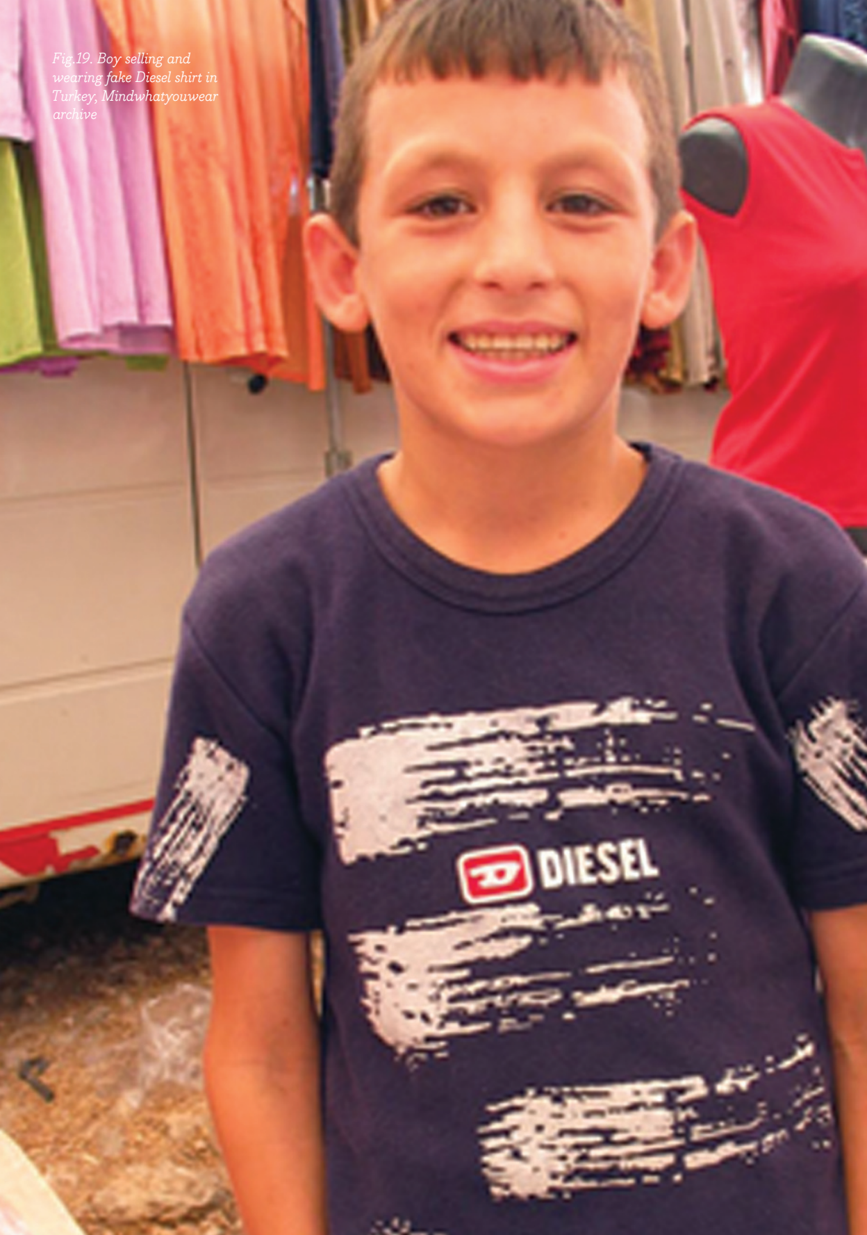
Fig.19. Boy selling and wearing fake Diesel shirt in Turkey