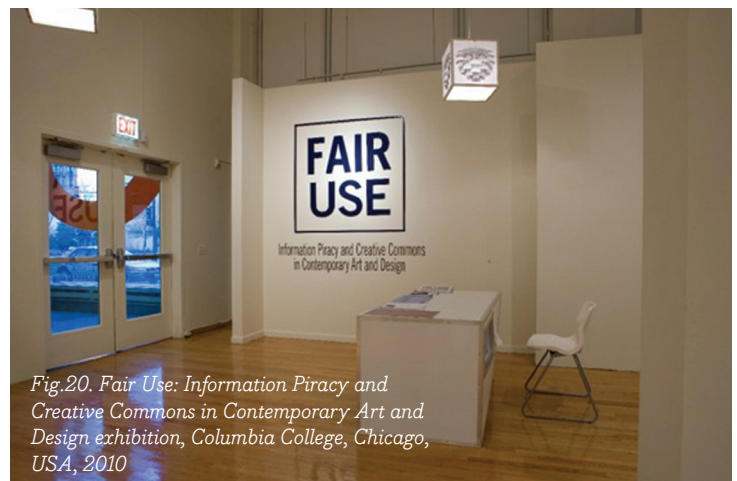
Fig.20. Fair Use: Information Piracy and Creative Commons in Contemporary Art and Design exhibition, Columbia College, Chicago, USA, 2010

Three years later, I got the dreaded letter from Louis Vuitton's Malletier law firm. I was ordered to stop selling the bags immediately or they would start a lawsuit against me. They also contacted my internet provider who threatened to block my site if I did not delete the pages. I was able to convince them that my goal was not selling counterfeits and making a profit on the goodwill of Louis Vuitton but rather promoting a discussion and hoping to bring more understanding about the issue. Since then I have been prohibited from selling the bags. But fortunately I was granted the right to exhibit the bags as well as publish the pictures as a "piece of art".