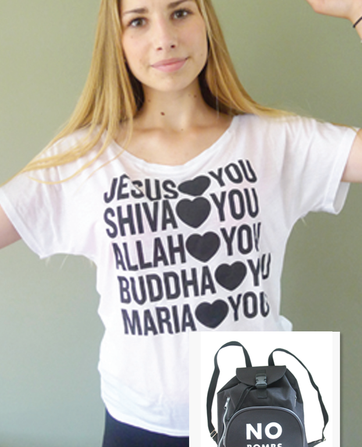
Fig.1. They all love you shirt, 2010, Mindwhatyouwear