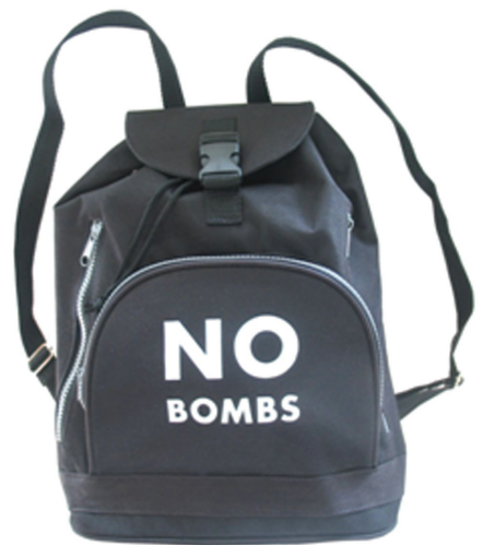
Fig.2. No Bombs bag, 2006, Mindwhatyouwear