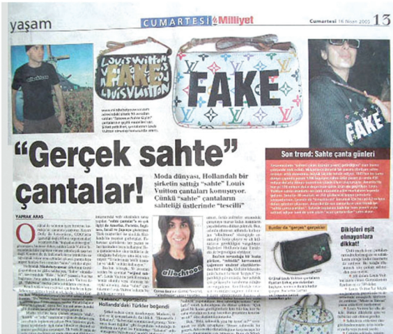
Fig.15. Press, Mindwhatyouwear archive